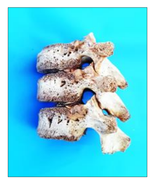
Figure 4a:3 Fused Thoracic vertebrae