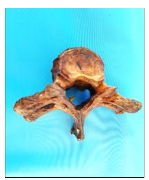
Figure 3b: Irregular vertebral foramen