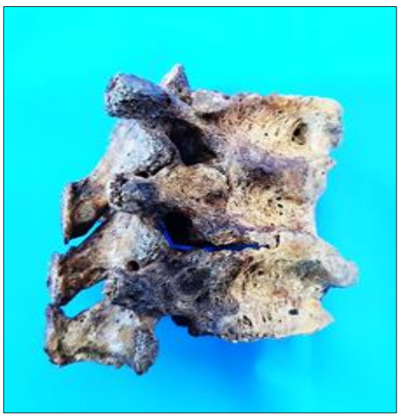
Figure 2a:3 Thoracic vertebrae-Fused