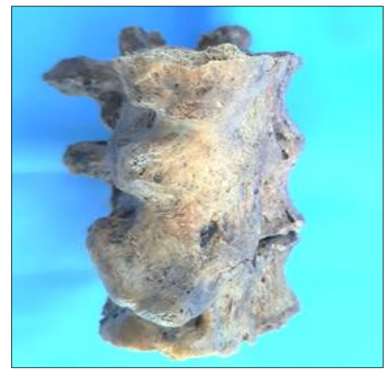
Figure 2b: Ossified Anterior longitudinal ligament