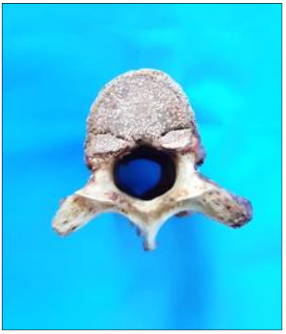
Figure 4b: Circular vertebral foramen