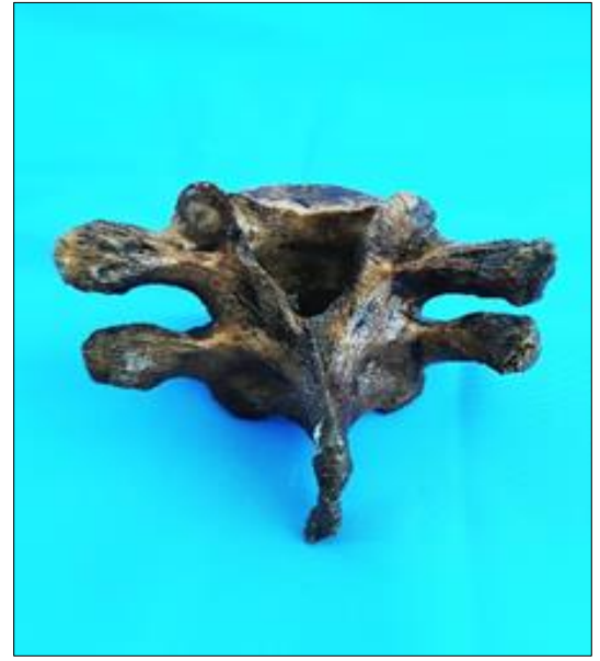
Figure 3a: Laminae, AP, SP-CF