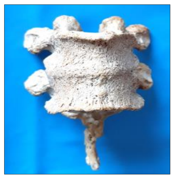
Figure 1: Vertebral body-CF

The results were tabulated below for the six fused thoracic vertebrae as follows in Table 1: