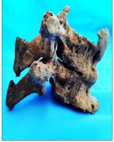
Figure 6: Vertebral body-PF, Ossified anterior longitudinal ligament